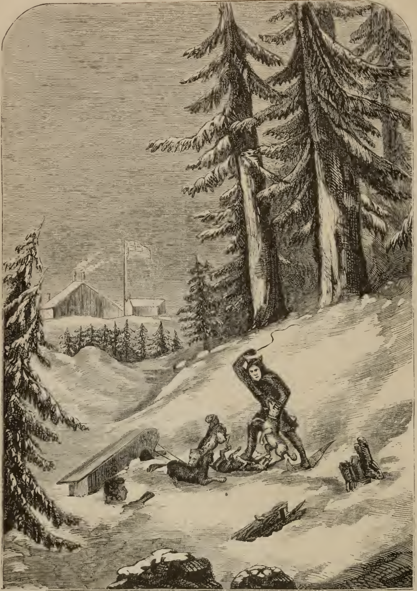
INCIDENT IN CARIOLE TRAVELLING.